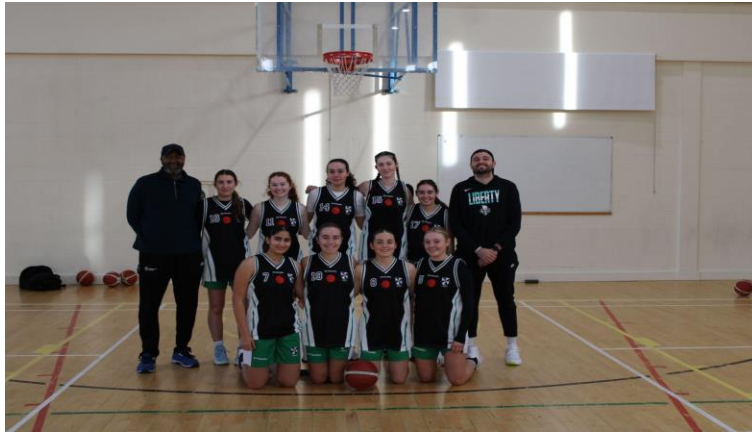
Basketball U'19 Team