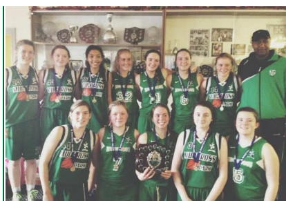
Senior basketball team win Dublin League