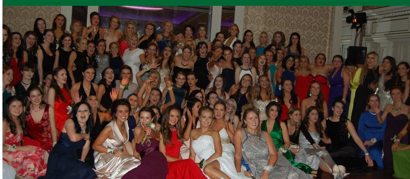
The Class of 2013 in all their finery at their Debs in the Shelbourne Hotel